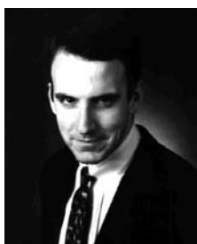
Edward Glaeser , Harvard University