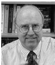
Wallace (Wally) Oates , University of Maryland